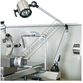
Coolant System and Work Light