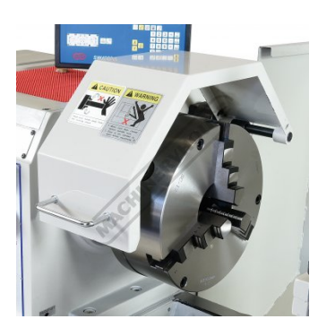
Safety Chuck Guard