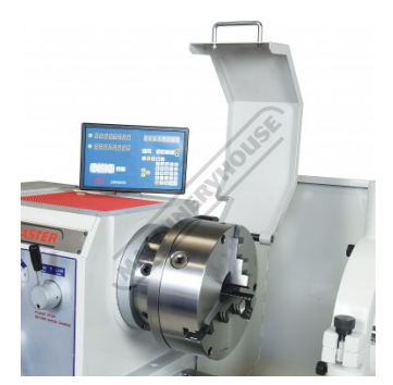
Safety Chuck Guard Open

sales@machineryhouse.com.au www.machineryhouse.com.au