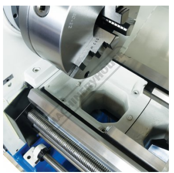
Removable Gap Bed