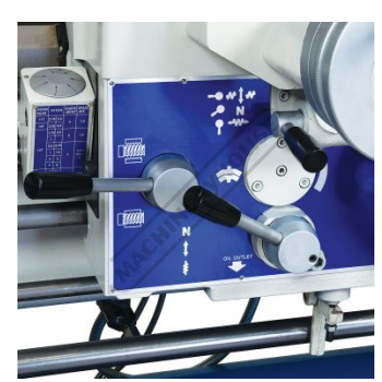
Feed Engagement Levers