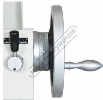
Tailstock Hand Wheel