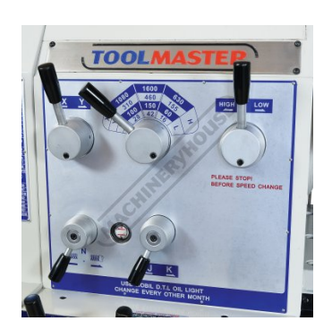
Spindle Speed Selectors