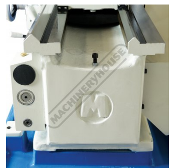
Meehanite Cast Bed