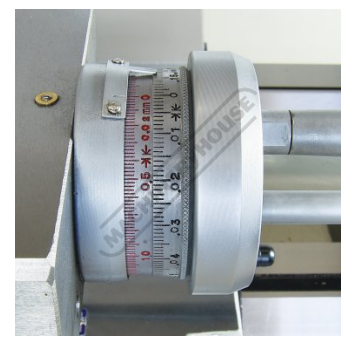
Compound Slide Hand Wheel