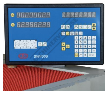
2 Axis Digital Readout