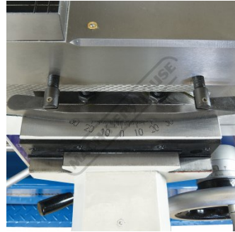
Compound Slide Angle Sclae