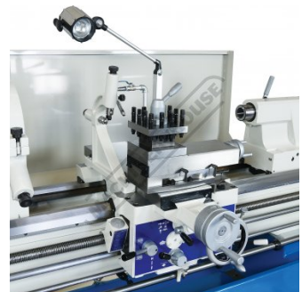
Saddle Left View