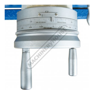
Cross Feed Hand Wheel