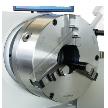
3 Jaw Chuck