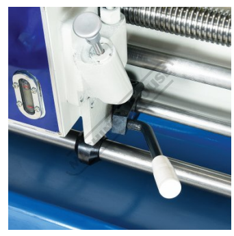
Spindle Engagement Lever