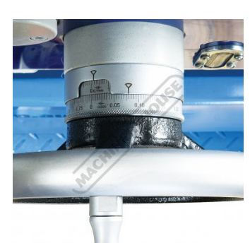
Saddle Hand Wheel