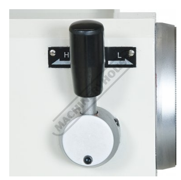
Tailstock Hand Wheel