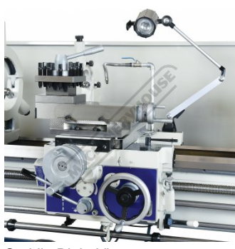
Saddle Right View