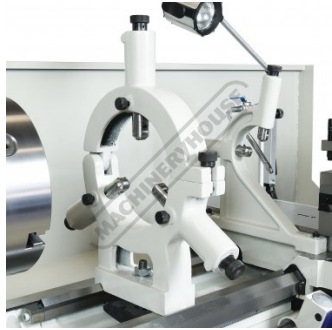
3 Point Steady