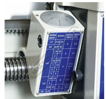
Thread Chasing Dial