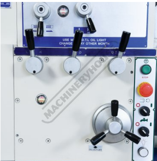
Universal Enclosed Gearbox