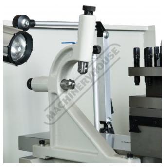
2 Point Steady