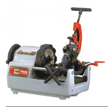
T024A Pipe Threading Machine -Automatic Die Head