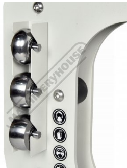
Die Storage Rack