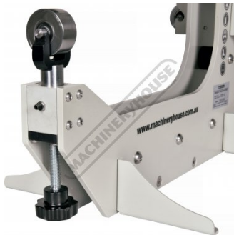
Lower Cradle Adjustment