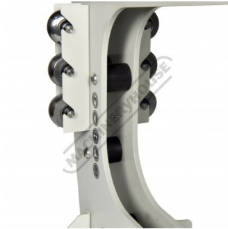
8mm Steel Plate Frame