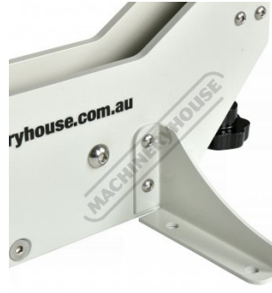
Bolt Holes For Bench Mount