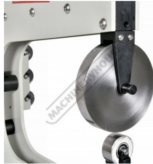
Top Wheel 146mm