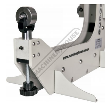
Lower Cradle Adjustment