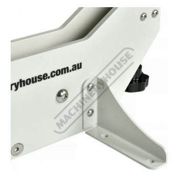
Bolt Holes For Bench Mount