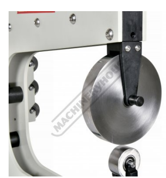
Top Wheel 146mm