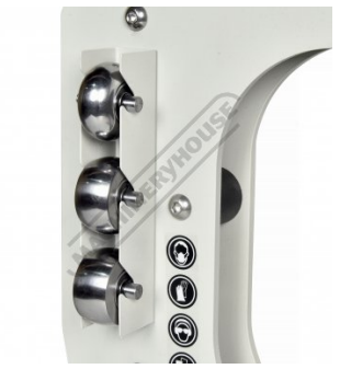
Die Storage Rack