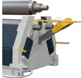
Standard Hydraulic Drop End