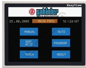
4-Axis CNC Controller Main Page