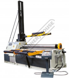
Shown with Optional Overhead Gantry & Hydraulic Lateral Supports