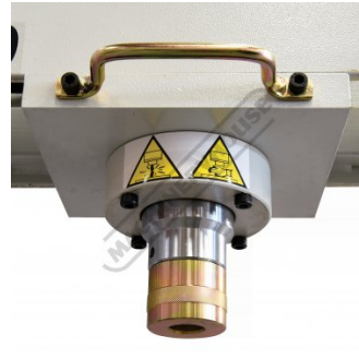
Adaptor Shown Attached To Ram