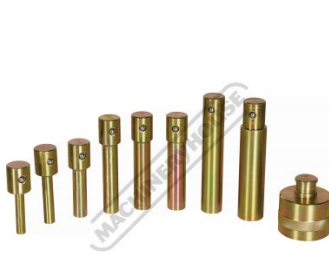
Pin Set & Adaptor