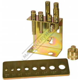
Pins Shown In Holder