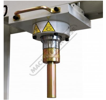
Pin Shown Attached To Adaptor