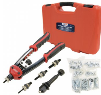
N001 Nut & Blind Riveter Set - 130 Piece