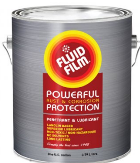
O044 Rust & Corrosion Preventive - Penetrant & Lubrication