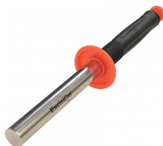
L300 Magnetic Swarf Remover