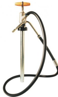
G040 Oil Transfer Pump