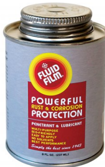
O043 Rust & Corrosion Preventive - Penetrant & Lubrication