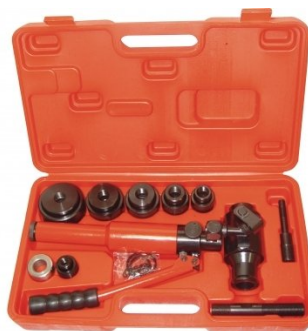
P020 Hydraulic Chassis Punch Set