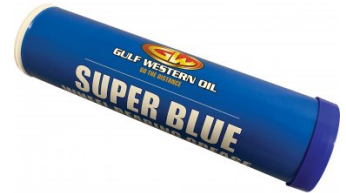
G057 Super Blue Complex Grease Cartridge