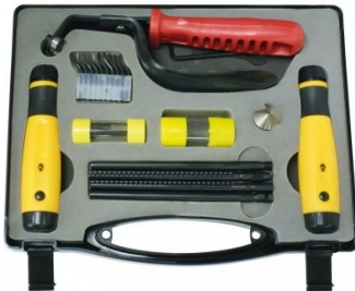
D065 Universal Deburring Tool Set - 23 Piece