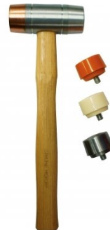
H875 Soft Face Hammer - 5 piece