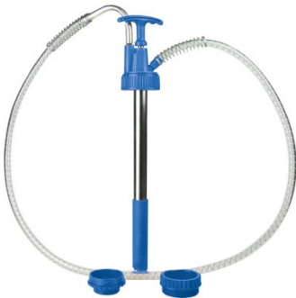
G077 Oil Transfer Pump