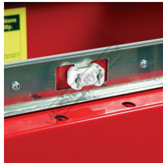
Detent Lock On Top Lid