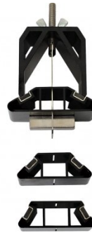
W114 3 Angles Welding Aluminium Clamp Set