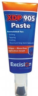
S075 Cutting Tool Lubricant Paste - 200g