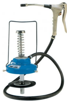
G060 Grease Gun