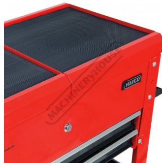
Protective Top Liner