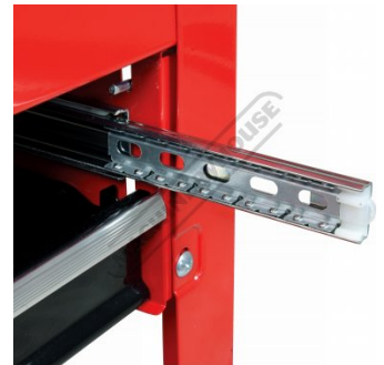
Ball Bearing Drawer Slides