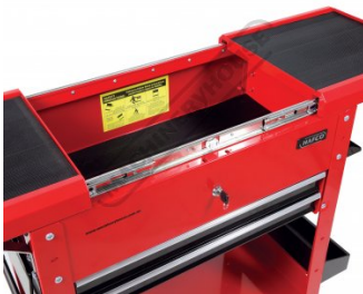
Slide Open Top For Storage