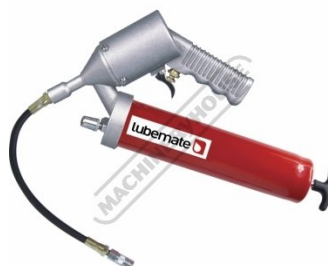
G074 Air Operated Grease Gun