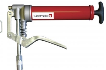
G070 Grease Gun