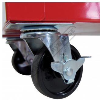
2 x Swivel Brake Wheels