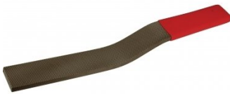
F160 Slapping File - Second Cut