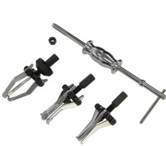
P013 Puller Set with Slide Hammer