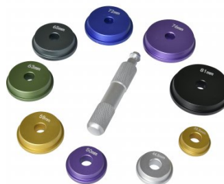
P031 Bearing Race & Seal Driver Set - 10 piece