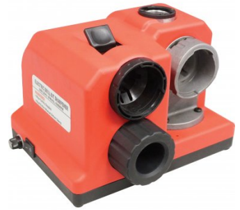
D070 Drill Sharpener