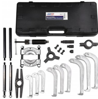
P011 Hydraulic Gear Puller Kit