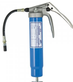
G063 Grease Gun