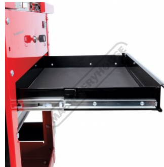
Drawer with Ball Bearing Slides