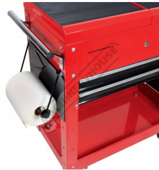
Paper Towel Holder