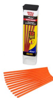
W104A Orange Trades Marker Refills - All Purpose