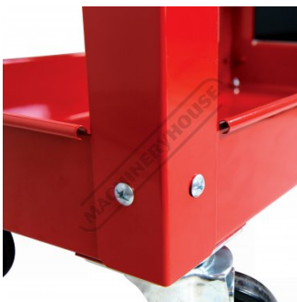
Rolled Safety Edges Bottom Shelf