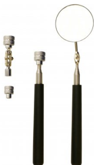
M0009 Magnetic Pick Up Tool & Inspection Mirror Set