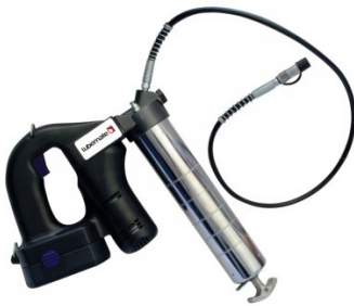
G068 Battery Operated Grease Gun