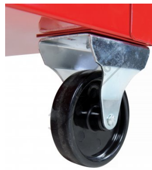
2 x Fixed Wheels