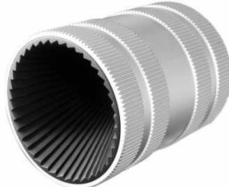
D068 Pipe/Tube Deburring Tool - Internal / External