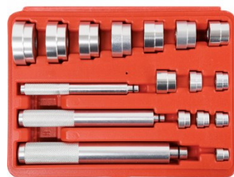
P030 Bush Driver Set - 17 piece