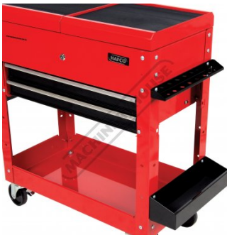
Open Bottom Storage Tray