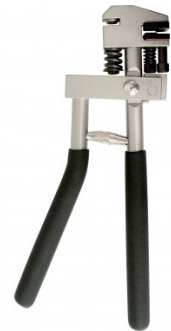
S200 Joggler & Punch Plier