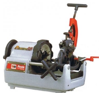
T024A Pipe Threading Machine - Automatic Die Head