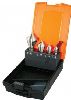
D1051 HSS Countersink Set - 4 Piece