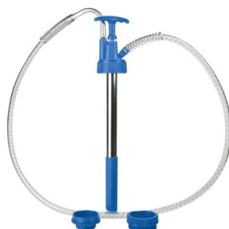
G077 Oil Transfer Pump