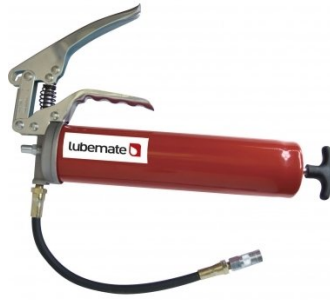
G072 Grease Gun