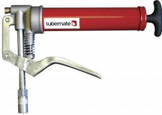
G070 Grease Gun