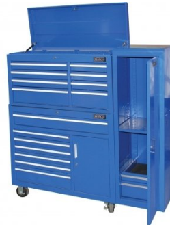
K005 Industrial Series Tool Box Package Deal