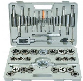
T014 Metric Alloy Steel Tap & Die Set - 45 Piece