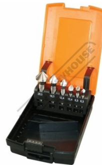
D1061 HSS Countersink Set 6 Piece