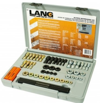
T117 Metric, UNC, UNF Thread Restorer Tap & Die Kit - 48 Piece