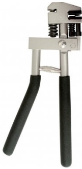
S200 Joggler & Punch Plier