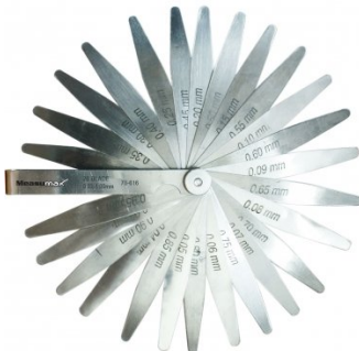
Q616 Feeler Gauge Set