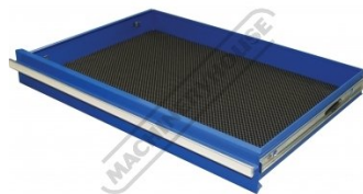
Drawer Front View