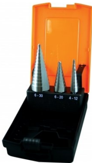
D1071 HSS Sheet Metal Step Drill Set - 3 Piece