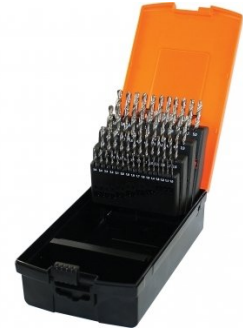
D1285 Metric Precision HSS Drill Set - 51 Piece