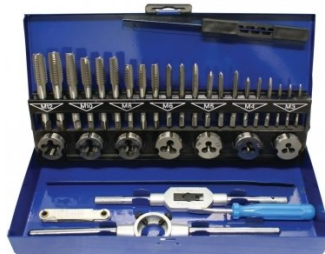
T012 Metric Alloy Steel Tap & Die Set - 32 Piece