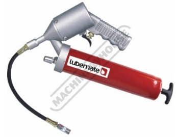
G074 Air Operated Grease Gun