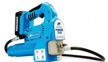
G067 Lithium-ion Battery Operated - Grease Gun