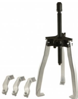
P005 Ratcheting Gear Puller Set