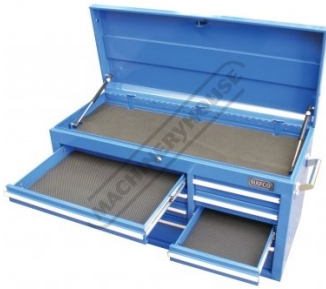
Shown with Draws Open