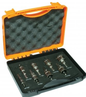
D108 Metric Carbide Tipped Hole Saw Set