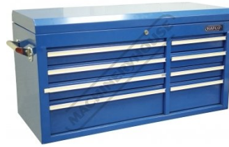
Show With Lid Closed