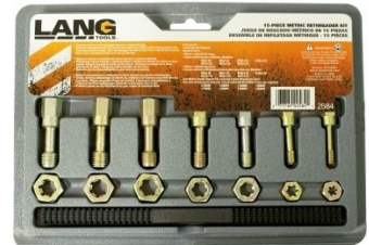
T115 Metric Thread Restorer Tap & Die Kit - 15 Piece