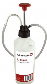
G076 Top Up Pump