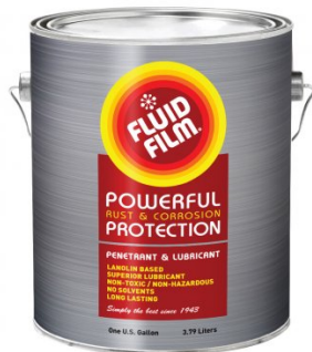
O044 Rust & Corrosion Preventive - Penetrant & Lubrication