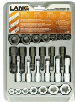
T116 Imperial Thread Restorer Tap & Die Kit - 26 Piece Set