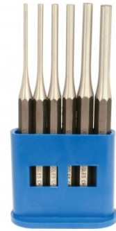
P365 Pin Punch Set - 6 Piece