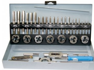
T013 Metric HSS Tap & Die Set - 32 Piece