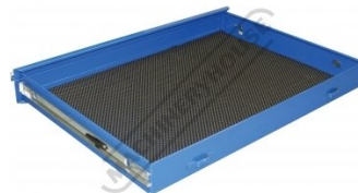
Drawer Rear View