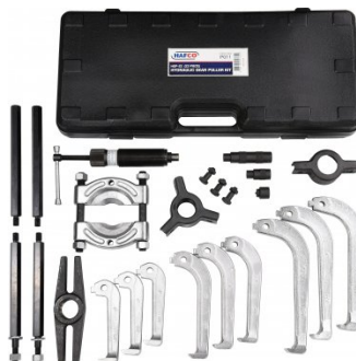
P011 Hydraulic Gear Puller Kit