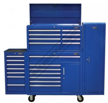
Package Deal Shown K005B