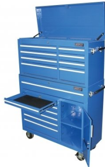
K005A Industrial Series Tool Box Package Deal