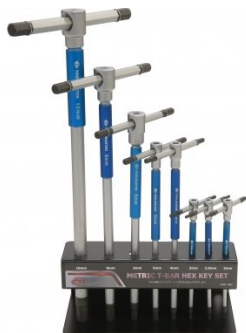
H820 Metric Hex Key Set with T-Bar Handle