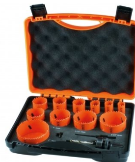
D102 Metric HSS Hole Saw Set