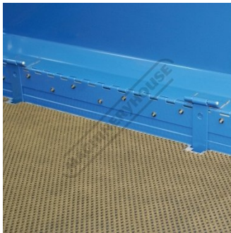
3 x Security Drawer Tabs on Top Lid with Full Length Hinge