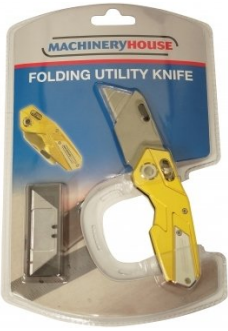
08048 Folding Utility Knife