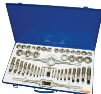
T016 Metric HSS Tap & Die Set - 45 Piece