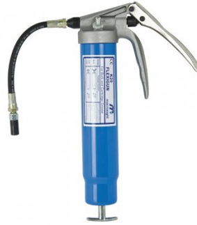
G063 Grease Gun