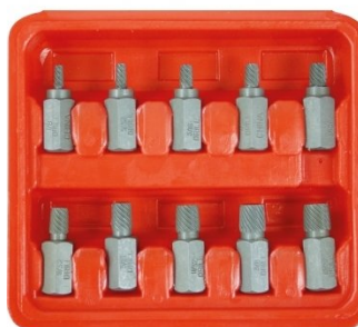
T870 Screw Extractor Set - 10 piece