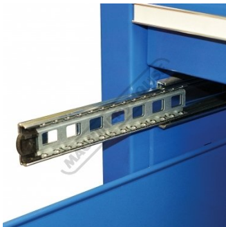
Ball Bearing Slide Drawers