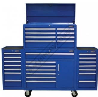
Package Deal Shown K005A + 2 x T727