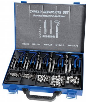
T100 Metric Thread Repair Kit - 130 Piece