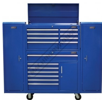
Package Deal Shown K005 + Additional T726