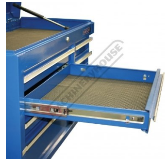
Drawers with Ball Bearing Slides