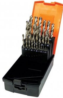
D1272 Metric Precision HSS Drill Set - 25 Piece