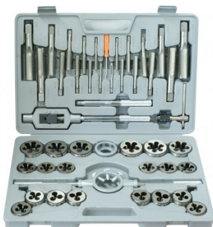
T015 Imperial Alloy Steel Tap & Die Set - 45 Piece