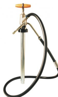
G040 Oil Transfer Pump