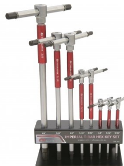
H821 Imperial Hex Key Set with T-Bar Handle