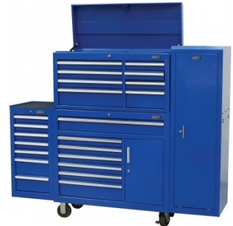
K005B Industrial Series Tool Box Package Deal