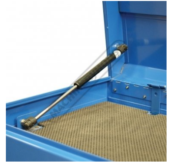
2 x Gas Struts On Lid