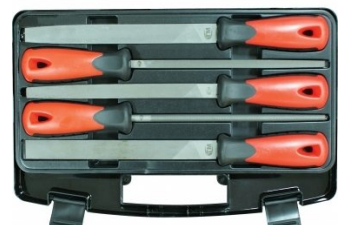
F100 Engineers Files, 5 Piece Set - Second Cut