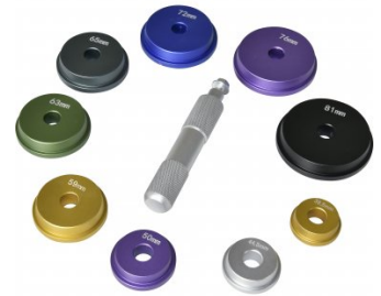
P031 Bearing Race & Seal Driver Set - 10 piece