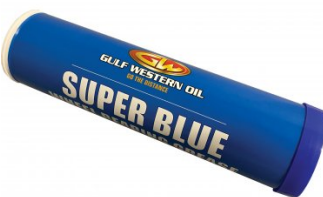
G057 Super Blue Complex Grease Cartridge