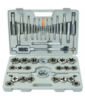
T015 Imperial Alloy Steel Tap & Die Set - 45 Piece