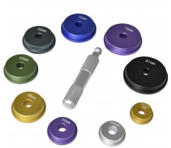
P005 Ratcheting Gear Puller Set