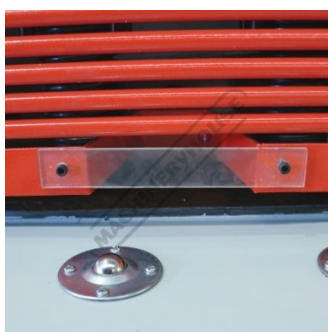
Hand Safety Access