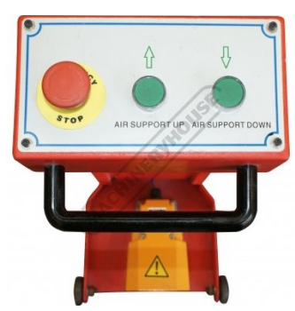
Pneumatic Sheet Support and Emergency Stop on Mobile Foot Control