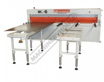
Shown with Optional Ball Transfer Tables - Order Code (L840)