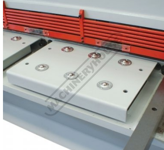
Material Transfer Balls