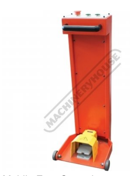
Mobile Foot Control