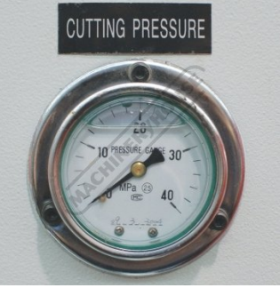
Cutting Pressure Gauge