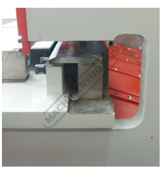
Open Throat for Slitting