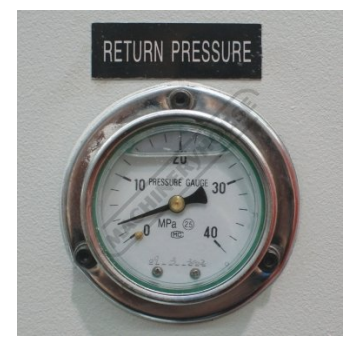
Return Pressure Gauge