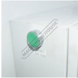
Rear Guard Reset Button