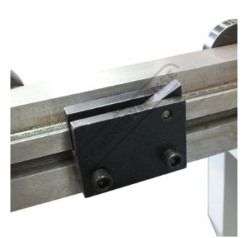
Adjustable Flip Over Stops

sales@machineryhouse.com.au www.machineryhouse.com.au