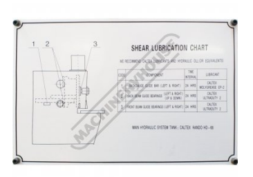
Machine Lubrication Chart