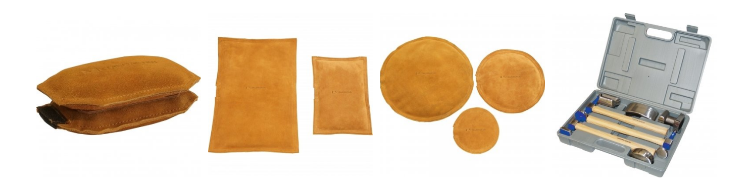
H886 Auto Panel Restoration Kit -Professional