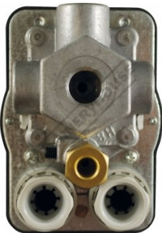
Bottom Of Pressure Switch