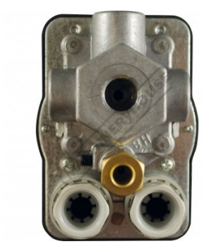
Bottom Of Pressure Switch