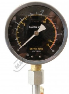
Metric / Imperial Pressure Gauge