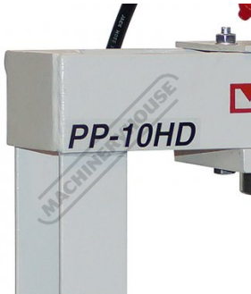
Robotic welded frame