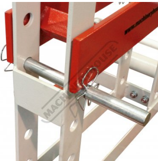
Table Pins With Safety Clips