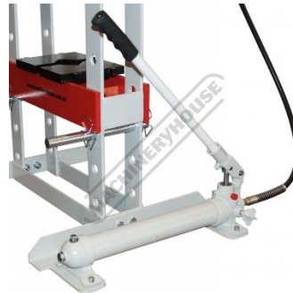
High Quality Hydraulics