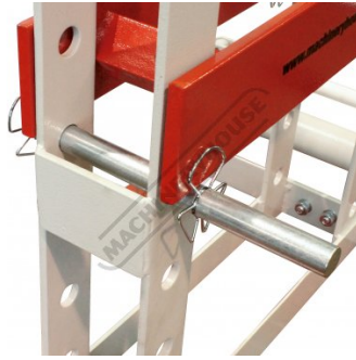
Table Pins With Safety Clips