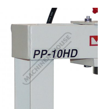
Robotic welded frame