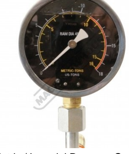
Metric / Imperial Pressure Gauge