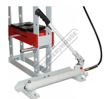
High Quality Hydraulics