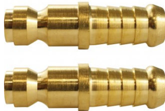
F906A Air Fittings