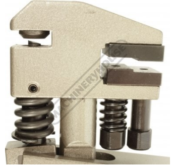
Hole Punch Side View