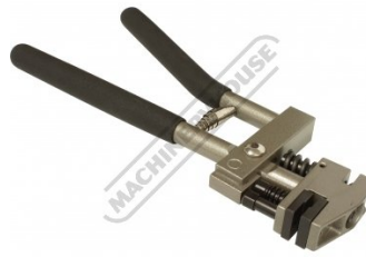
Crimp Flange Top View