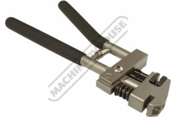
Hole Punch Top View