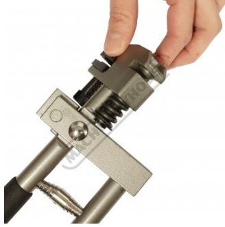
Swivel Head Action