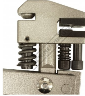
Head Side View