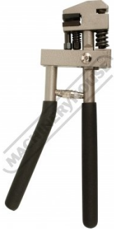
Hole Punch Set Up