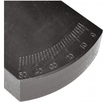
Adjustable Cutting Angle Up to 50 Degrees