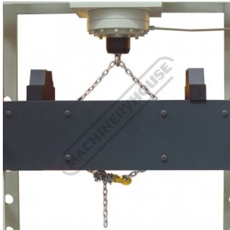
Table Height Adjustment