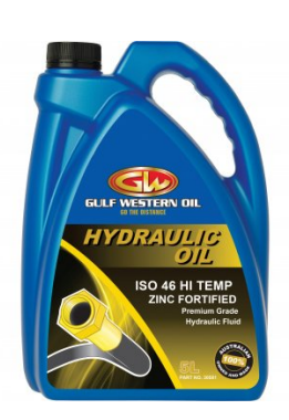
O004 Superdraulic 46 Hydraulic Oil