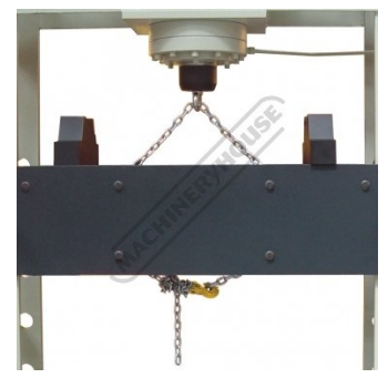
Table Height Adjustment