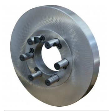
02/07/2023 7:15 AM