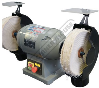
Buffing Wheel Safety Shield and Dust Chute