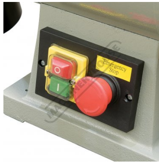
Safety Magnetic Switch Right View