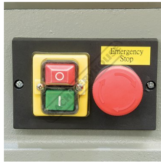
Safety Magnetic Switch