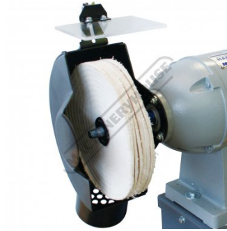
Buffing Mop and Guard