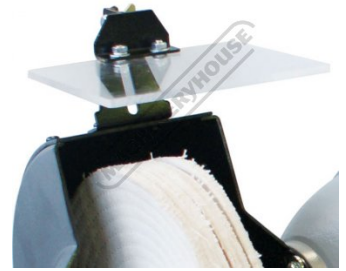
Adjustable Eye Shields