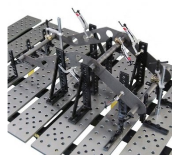
Shown Welding with Optional Accessories Setting Up Go Cart Frame Shown with Optional Accessories Setting Up Sheetsteel Shown with Optional Accessories Setting Up Frame