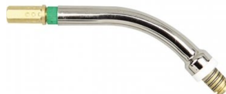
W562A Swan Neck Assembly