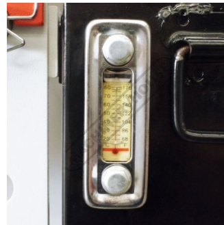
Hydraulic Oil Level Gauge