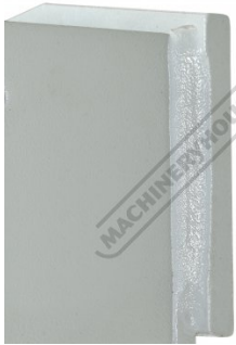
Robotic Welded Frame