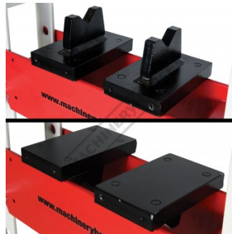
Dual Purpose Pressing Blocks