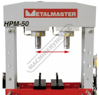
Horizontal Sliding Ram