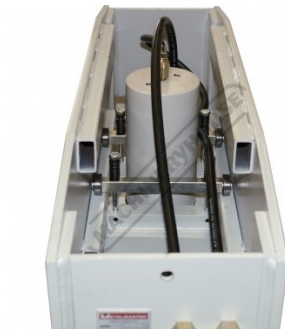
Ram Top With Bearing Slide