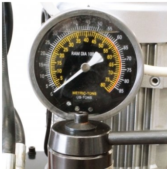
Metric / Imperial Pressure Gauge