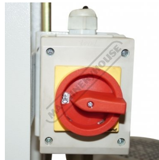
Main Power Isolation Switch