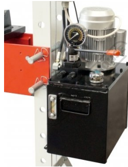
Electric Hydraulic Pump Unit