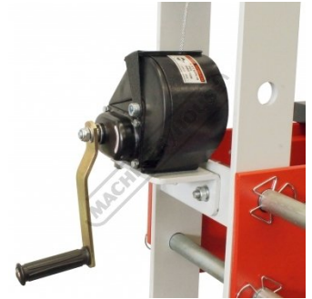
Table Winch Height Adjustment