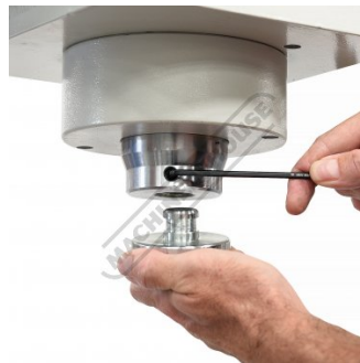
Includes Removable Ram Top Cap