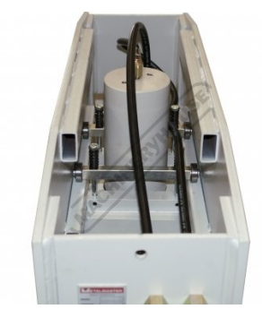
Ram Top With Bearing Slide