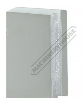
Robotic Welded Frame