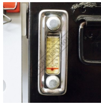
Hydraulic Oil Level Gauge