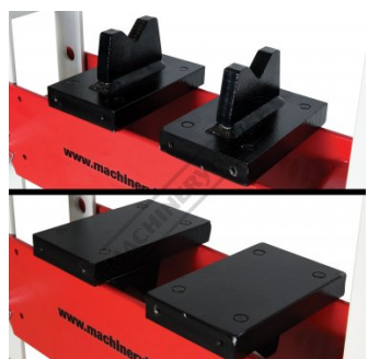
Dual Purpose Pressing Blocks