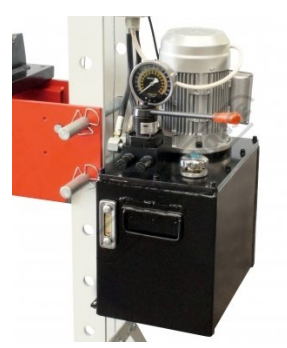
Electric Hydraulic Pump Unit