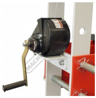
Table Winch Height Adjustment