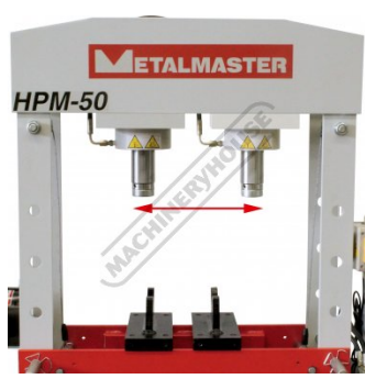
Horizontal Sliding Ram