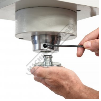
Includes Removable Ram Top Cap Main Power Isolation Switch