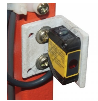
Safety Omron E3ZS Rear Light Sensor Guarding