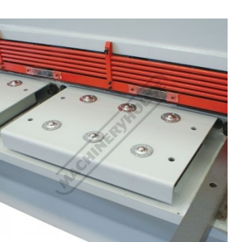
Material Transfer Balls