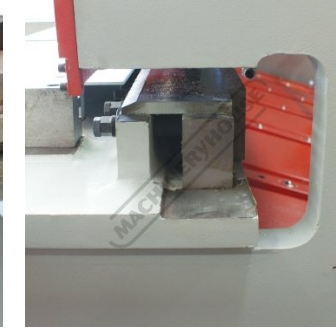
Open Throat for Slitting