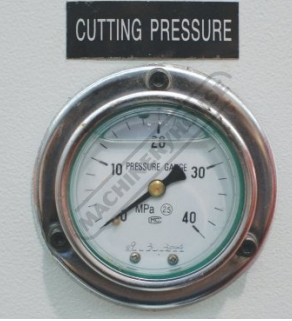
Cutting Pressure Gauge