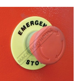
Emergency Stop Switch