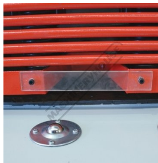
Hand Safety Access