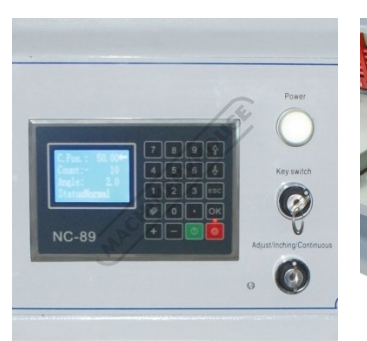
Ezy Set NC 89