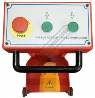
Pneumatic Sheet Support and Emergency Stop on Mobile Foot Control