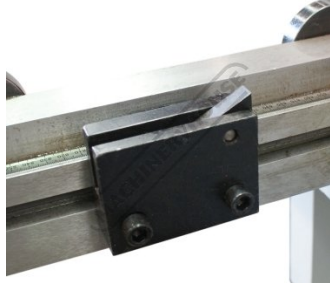
Adjustable Flip Over Stops

sales@machineryhouse.com.au www.machineryhouse.com.au