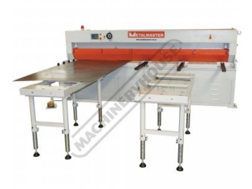
Fine Adjustment Dial for Backgauge Shown with Optional Ball Transfer Tables - Order Code (L840)