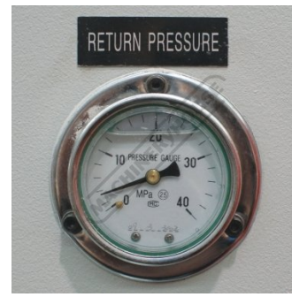
Return Pressure Gauge