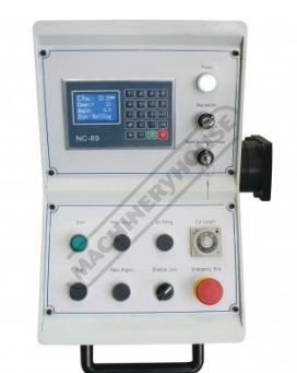
Controller with NC 89