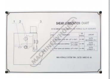
Machine Lubrication Chart