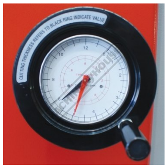
Variable Blade Gap Adjustment Dial