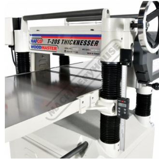
Robust 4 Post Design