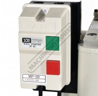
Magnetic Safety Switch