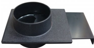
W336 Dust Hose Elbow