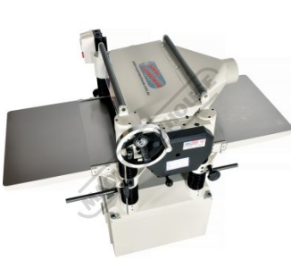
Cast Iron Feed Tables