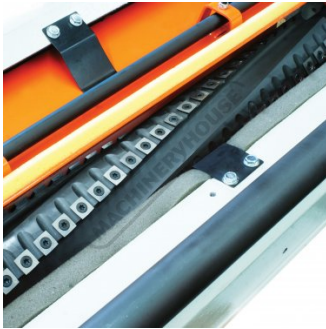
4 x Spiral Cutter Head with Carbide Inserts