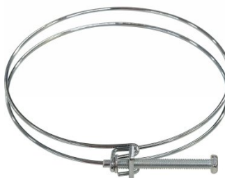
W341 Dust Hose Clamp