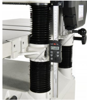
Digital Height Readout