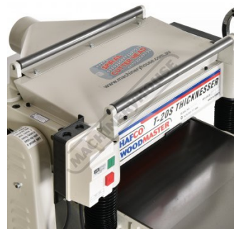
Feed Return Rollers