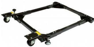
W931 Mobile Base - Heavy Duty