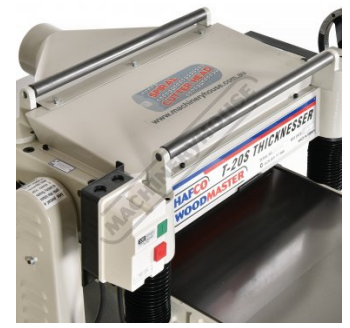
Feed Return Rollers