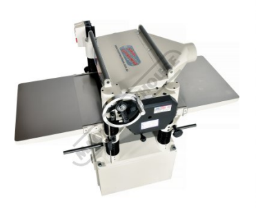
Cast Iron Feed Tables