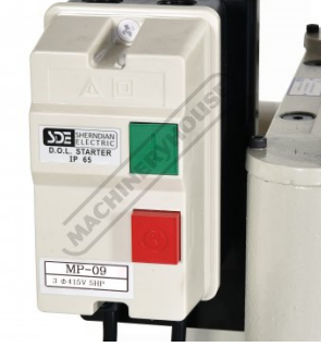
Magnetic Safety Switch