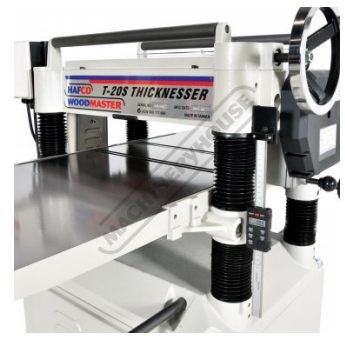
Robust 4 Post Design