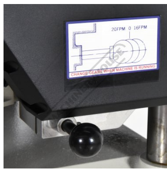
2 Speed Feed Gearbox