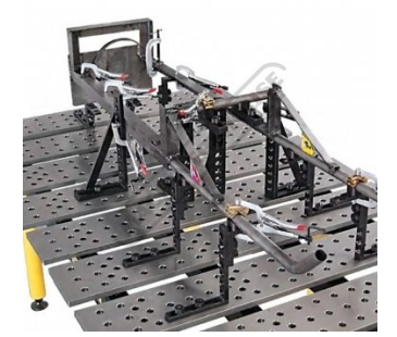
Shown with Optional Accessories Setting Up Frame 2 Shown with Optional Accessories Setting Up Frame 3 Shown with Optional Accessories Setting Up Frame 4 Shown with Optional Accessories Setting Up Frame 5