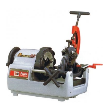
T024A Pipe Threading Machine -Automatic Die Head