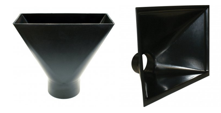
W338B Wood Lathe - Dust Chute - Big Gulp