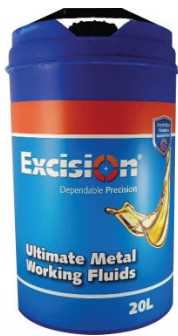
S091 Soluble Metal Cutting Fluid - 20 Litre