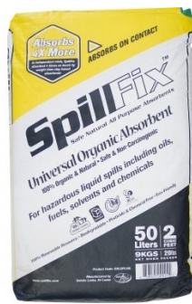
O000 SpillFix Universal Organic Absorbent