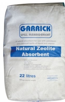
O000A Natural Zeolite Absorbent