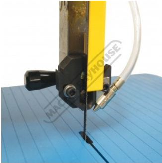
Blade Air Pump