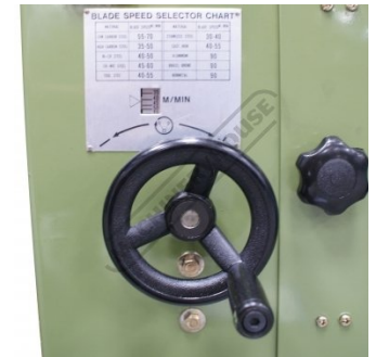
Variable Speed Handle