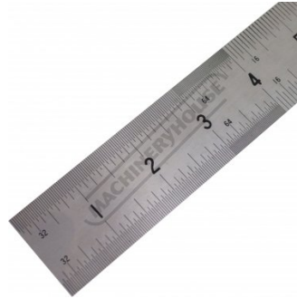
Imperial Close Up