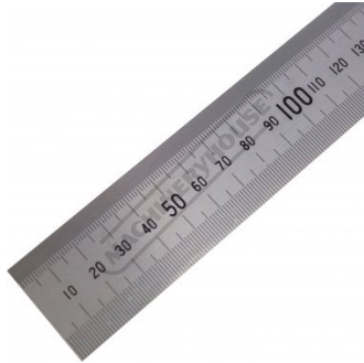
Metric Close Up