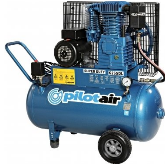
C511 Pilot Super Duty Air Compressor