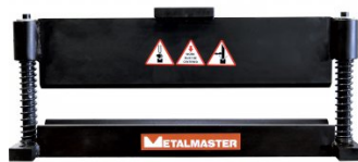
P450 Pressbrake Attachment - Suits Hydraulic Presses