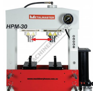
Horizontal Sliding Ram