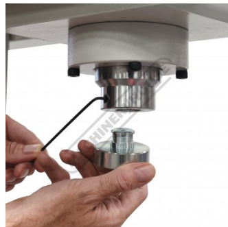
Includes Removable Ram Top Cap