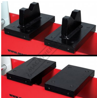
Dual Purpose Pressing Blocks