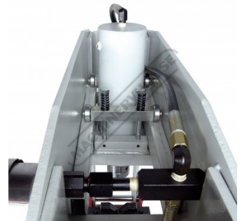
Ram Top View With Bearing Slide