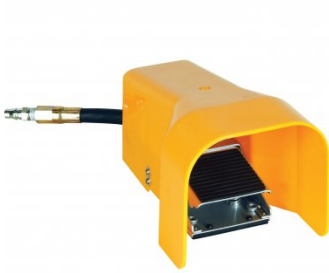
P1400 Pneumatic Foot Control