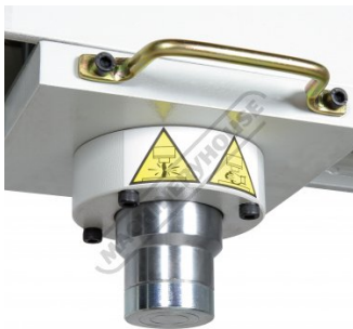
Sliding Ram With Handle