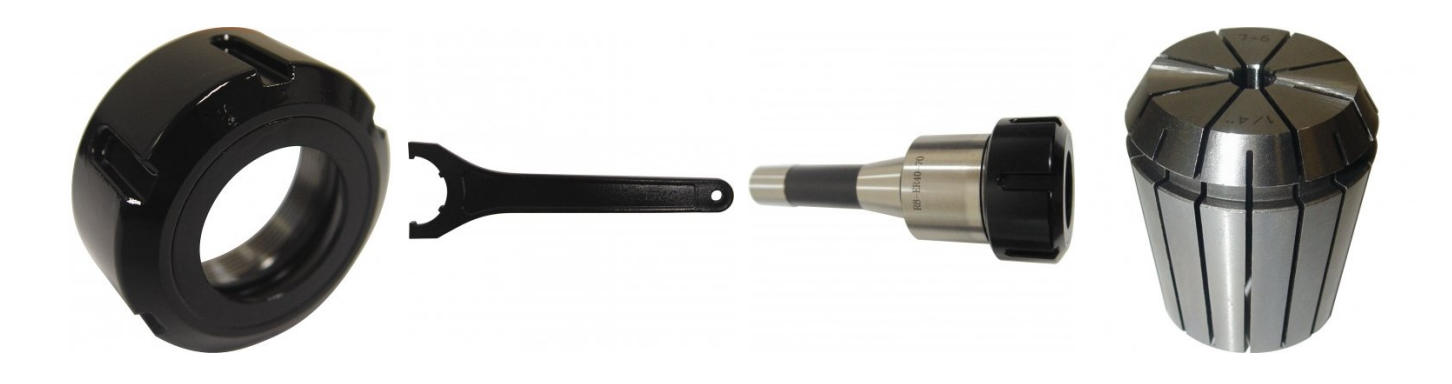
C937 ER40 Collet