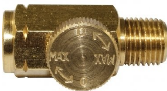
A219 Air Fittings