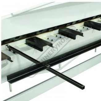
Rear Manual Backgauge