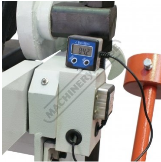
Digital Angle Readout