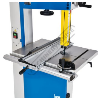
Rip Fence Shown In Low Position