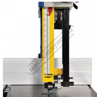
Blade Height Scale