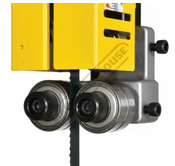
Ball Bearing Blade Guide