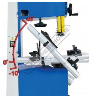
Table Adjustment Angles