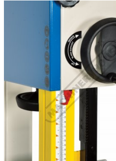
Adjustment Rack Pinion Cut Height