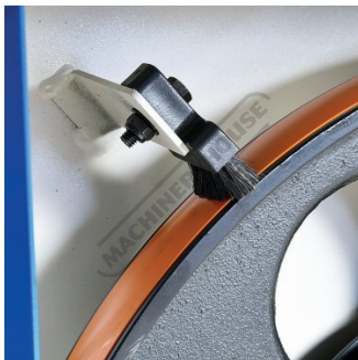
Wheel Cleaning Brush