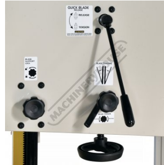
Quick Action Blade Tension Lever