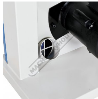
100mm Bottom Rear Dust Chute