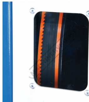
Blade View Window