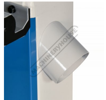
100mm Side Dust Chute