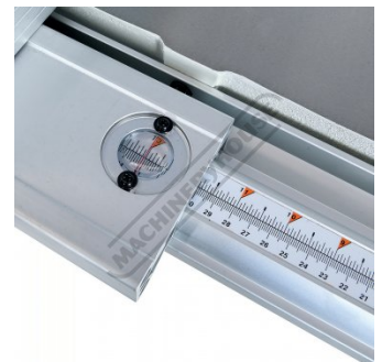
Rip Fence With Magnification Scale View