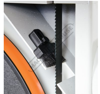
Blade Cleaning Brush