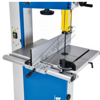
Rip Fence Shown In High Position