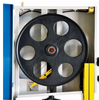
Heavy Duty Cast Iron Wheels