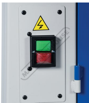
On Off Switch