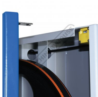
Safety Micro Switch On Door