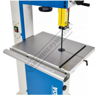
Large Cast Iron Work Table