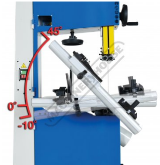
Table Adjustment Angles