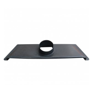
W338 Dust Hose Universal Dust Hood