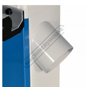
100mm Side Dust Chute