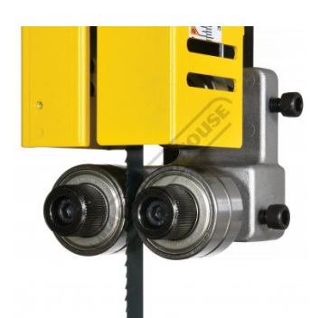
Ball Bearing Blade Guide