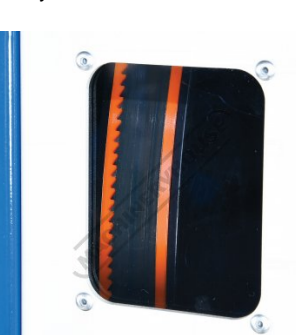
Blade View Window