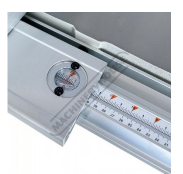
Rip Fence With Magnification Scale View