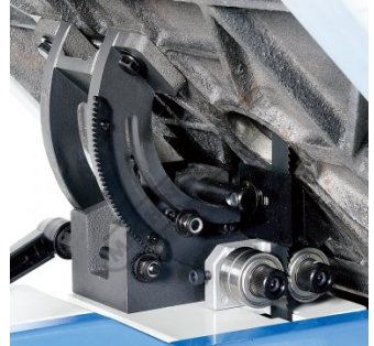
Lower Ball Bearing Blade Guide

sales@machineryhouse.com.au www.machineryhouse.com.au