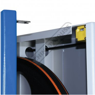
Safety Micro Switch On Door