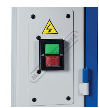
On Off Switch