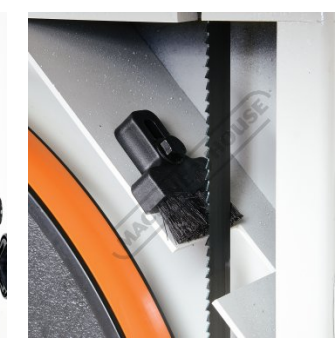
Blade Cleaning Brush