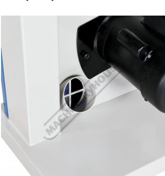
100mm Bottom Rear Dust Chute