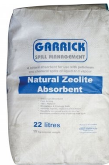
O000A Natural Zeolite Absorbent