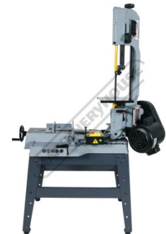
Shown with Vertical Cutting Table