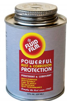
O043 Rust & Corrosion Preventive - Penetrant & Lubrication