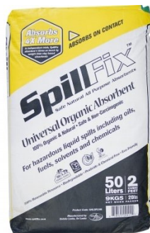
O000 SpillFix Universal Organic Absorbent