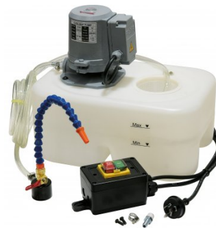
P235 Coolant Pump & Tank