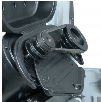
3 Speed Pulley Drive System