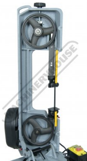
Blade Drive System