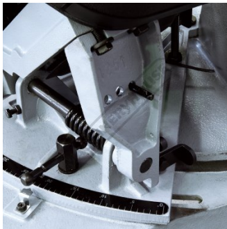
Adjustable Spring To Set Cutting Beam Force