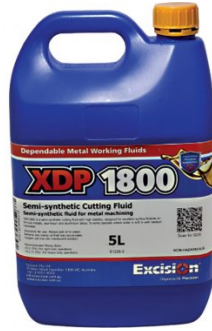
S090 Soluble Metal Cutting Fluid - 5 Litre