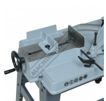
Vice Clamping Fixture