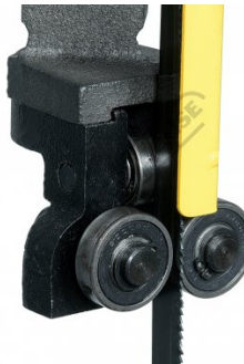
Front Ball Bearing Blade Guides