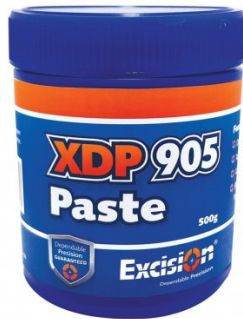
S074 Cutting Tool Lubricant Paste - 500g