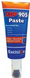
S075 Cutting Tool Lubricant Paste - 200g