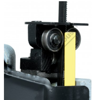
Rear Ball Bearing Blade Guides