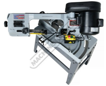
Top View at 45 Degrees