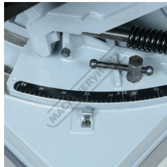
Swivel Head Scale Set at 30 Degrees