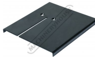
Includes Vertical Cutting Table