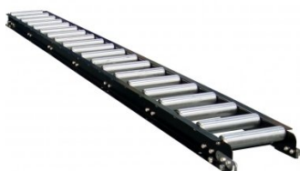
L812 Roller Conveyor