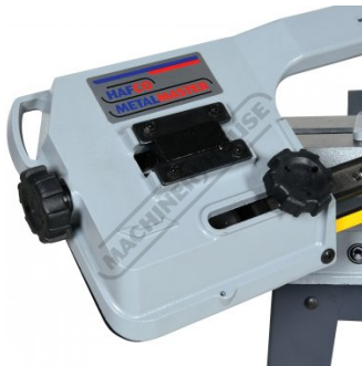
Blade Tension Dial