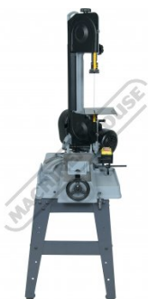
Vertical Cutting Table Front View