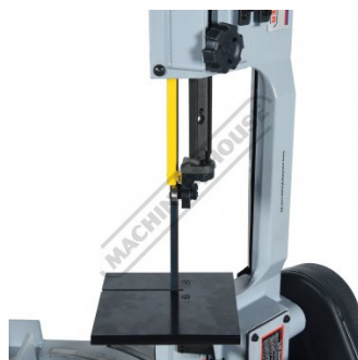
Vertical Cutting Table Close Up