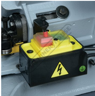
Automatic Electric Cut Out Switch