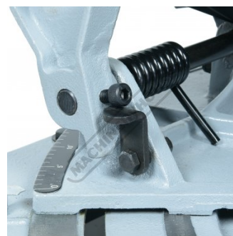
Vertical Head Position Safety Latch