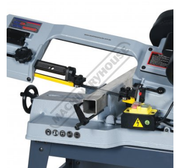
Shown Cutting Steel Tube