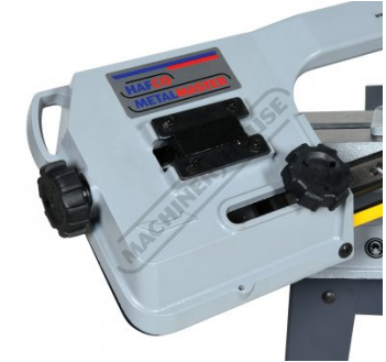
Blade Tension Dial