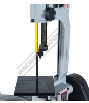
Vertical Cutting Table Close Up