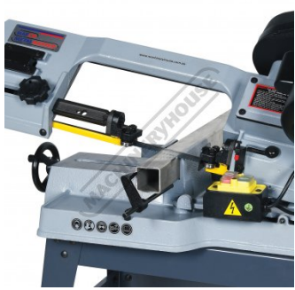
Shown Cutting Steel Tube