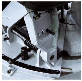
Adjustable Spring To Set Cutting Beam Force