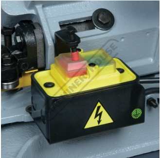
Automatic Electric Cut Out Switch

sales@machineryhouse.com.au www.machineryhouse.com.au