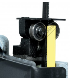
Rear Ball Bearing Blade Guides