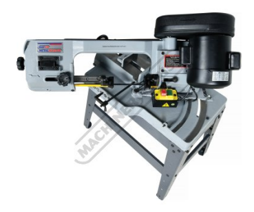
Top View at 45 Degrees