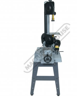
Vertical Cutting Table Front View