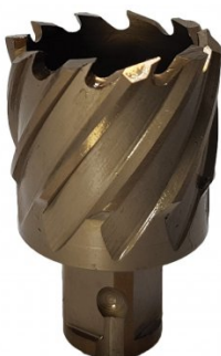
D936 HSS-Co (5% Cobalt) Drill Broach Cutter