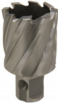
D9534 HSS Drill Broach Cutter