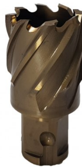
D930 HSS-Co (5% Cobalt) Drill Broach Cutter