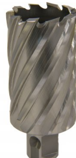
D9576 HSS Drill Broach Cutter