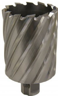
D9584 HSS Drill Broach Cutter