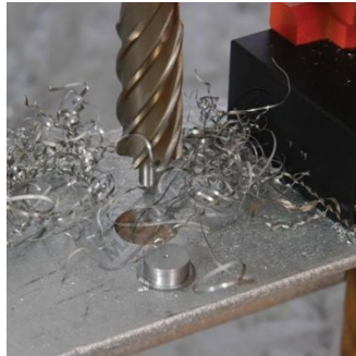
Shown in Action