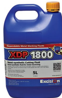
S090 Soluble Metal Cutting Fluid - 5 Litre