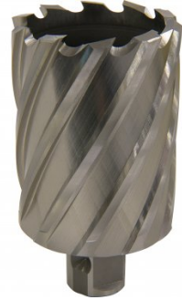
D9582 HSS Drill Broach Cutter