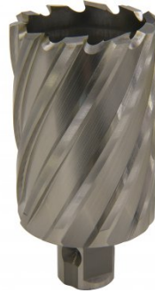
D9580 HSS Drill Broach Cutter