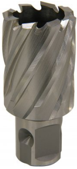
D9528 HSS Drill Broach Cutter