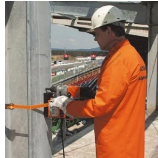
Shown in Action on Job Site