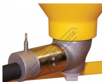
Bottom Hose Connection