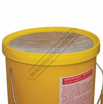
Removable Gauze Lid