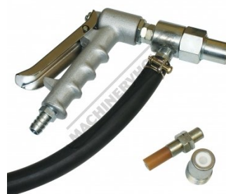
Gun and Tips