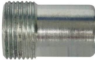
8SC1072 NOZZLE 5/16"