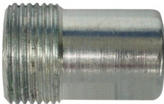
8SC1074 NOZZLE 1/2"