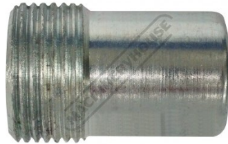
8SC1071 NOZZLE 3/16"