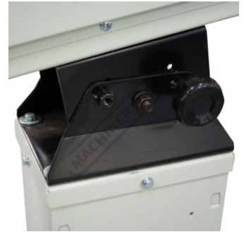
Head Tilt Adjustment