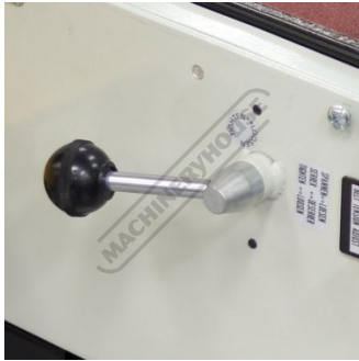
Belt Tension Lever