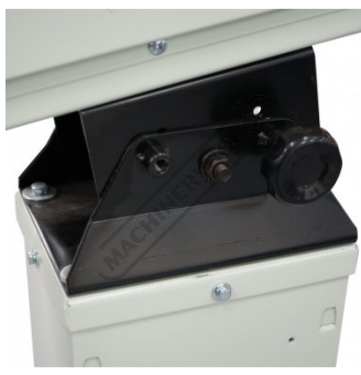
Head Tilt Adjustment