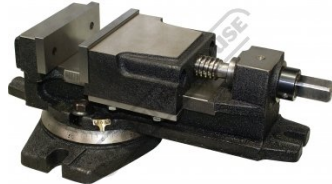
Shown without Handle