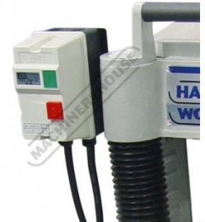
Magnetic Safety Switch