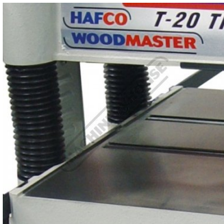
Robust 4 Post Design