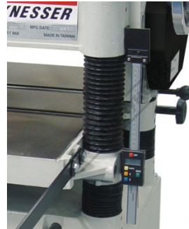
Digital Height Readout