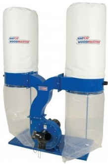
W329 Dust Collector