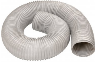
W398A PVC Dust Hose (Sold Per Metre)