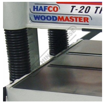
Robust 4 Post Design