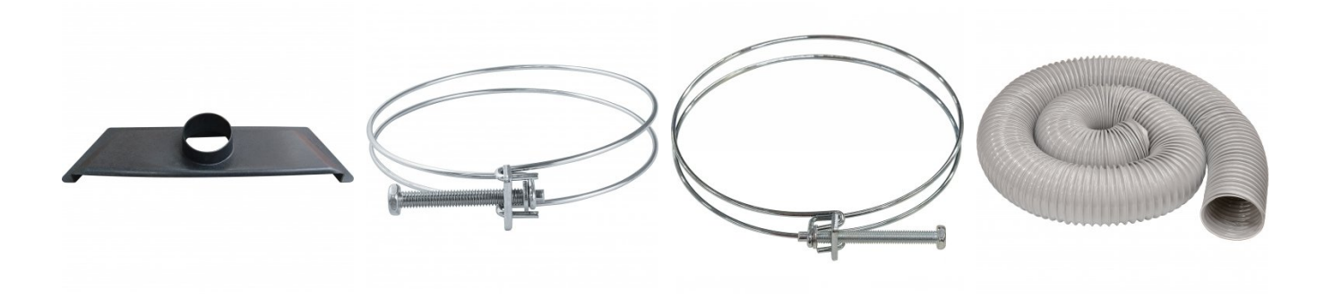
W398 PVC Dust Hose (Sold Per Metre)